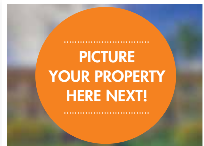
DON'T BE LEFT BEHIND!

presented to you exclusively by your SENIOR Real Estate Broker Associate: