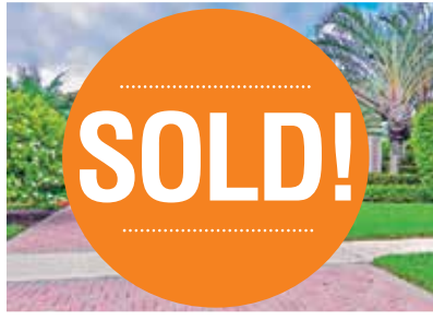
VILLAGE OF ORIOLE