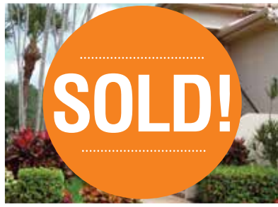
GLENEAGLES COUNTRY CLUB